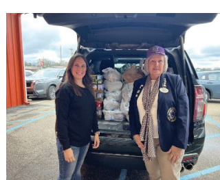
District 30-S Super Heroes of Service project for the LCI Hunger Week Initiative Food Collection. Donation was made to the Overflow Church, Magee, MS Food Pantry