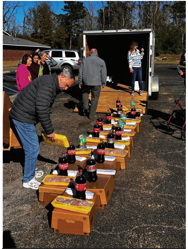
Members of the McComb and Biloxi Lions Club delivered holiday food baskets to the residents of the Willows and Pine Hills communities.